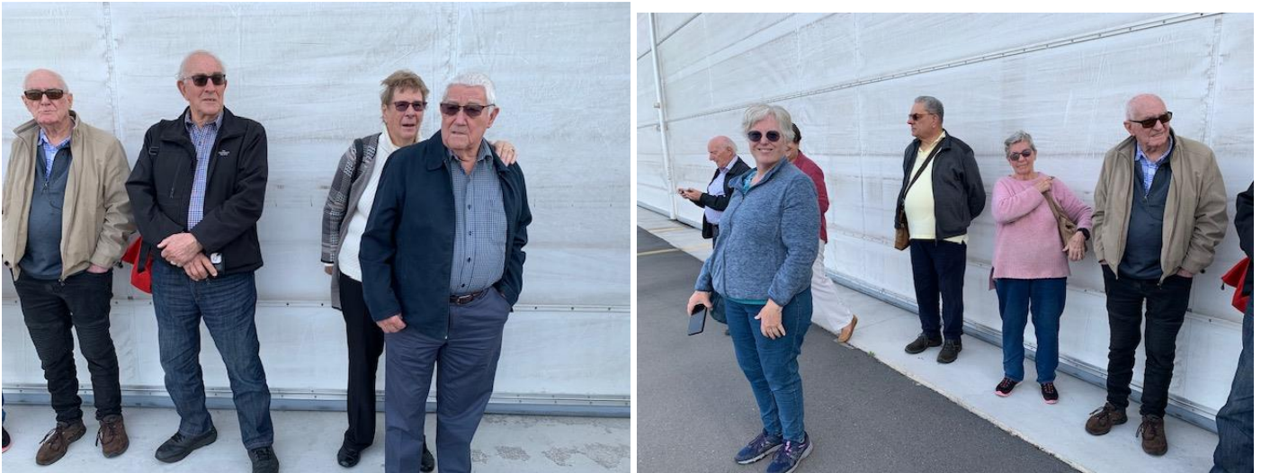
Enjoying Lunch at Café Sylvanas