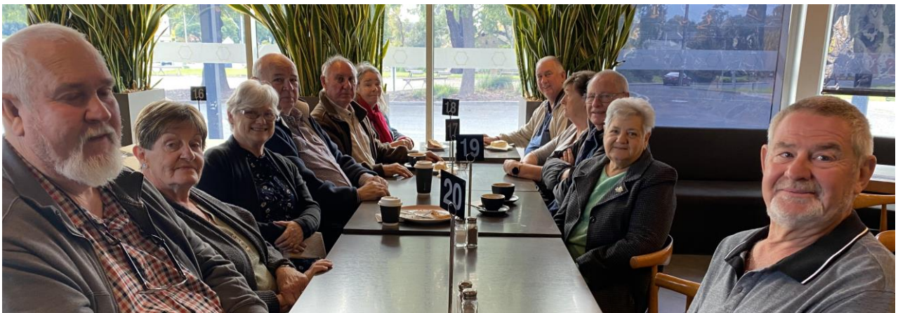
Coffee May 18th – The Nest