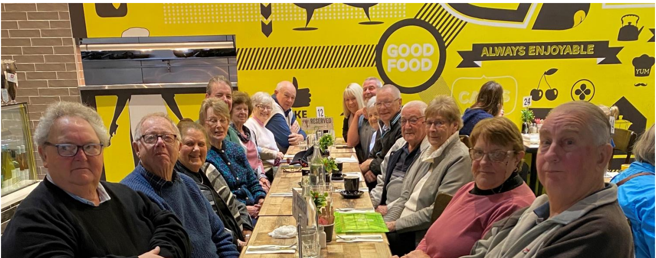
Coffee July 20 th Zee's Eatery