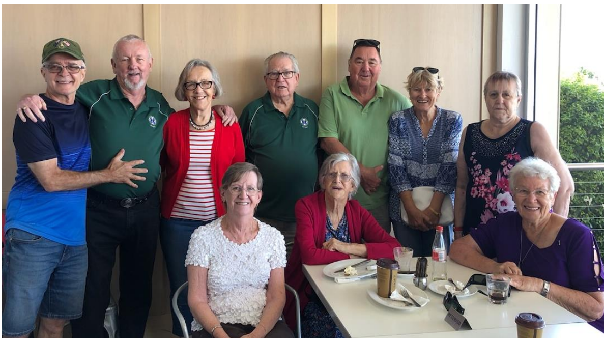
January 6 th Waikerie