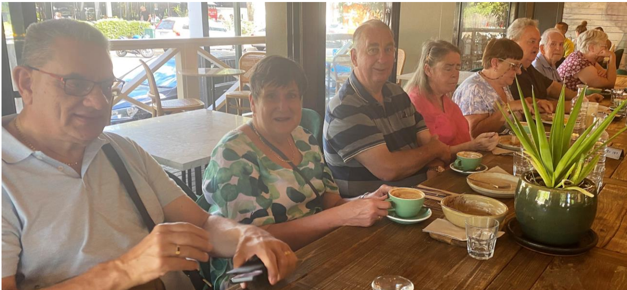
Coffee February 16th