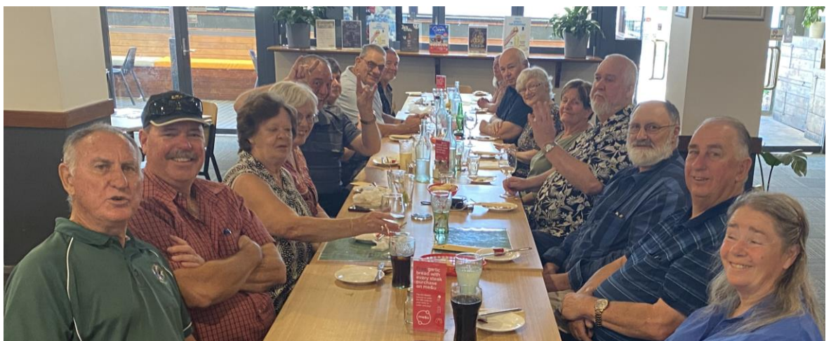
Exeter Hotel February 14th