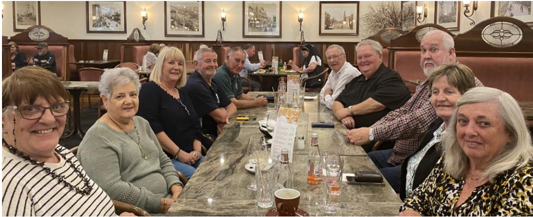
Lunch April 11 th – Donchos Cafe