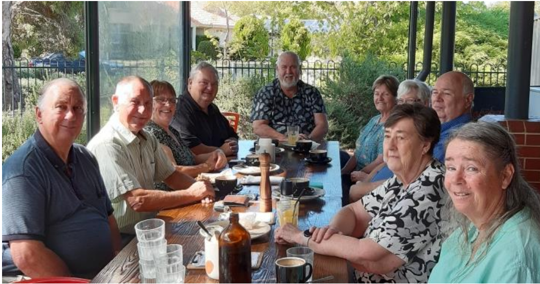
Coffee March 16th – Lakeside Cafe